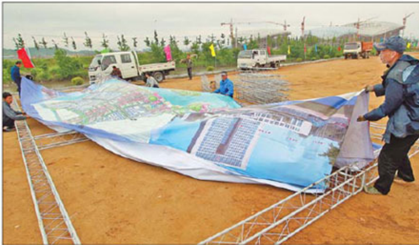
Workmen set up a billboard for the opening of the new industrial complex at Hwanggumpyong

According to a source familiar with North Korean affairs, the city has seen both new factories built and upgrades of previous ones in recent months.