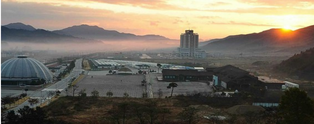
Mount Kumgang resort

On June 17 North Korea informed South Korean investors involved in the inter-Korean tourism project at Mount Kumgang to visit the tourism district by June 30 for talks on ways to withdraw all their assets.