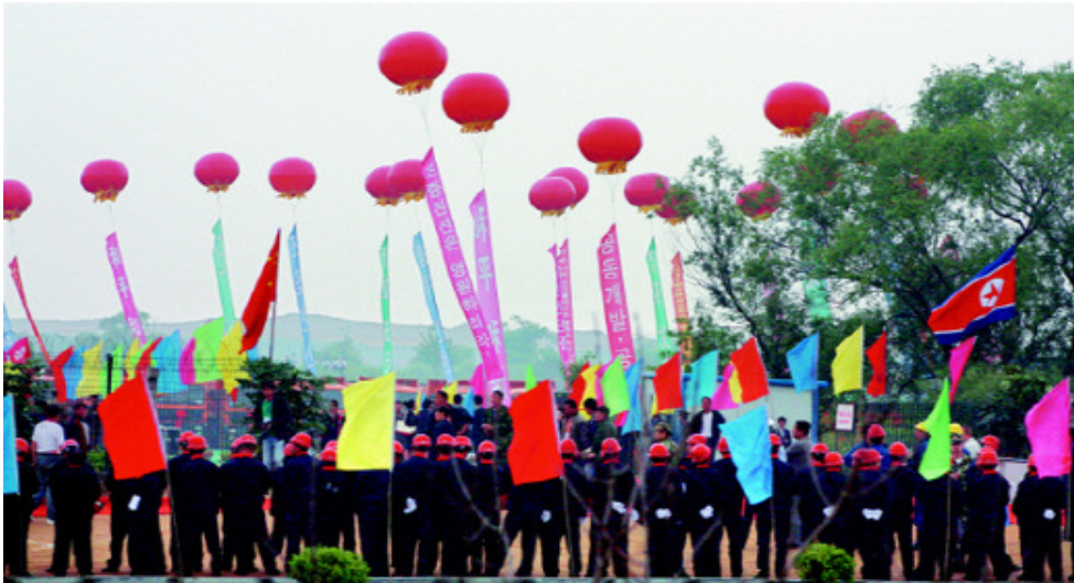
Scene at the groundbreaking ceremony

North Korea and China celebrated the groundbreaking of a joint free trade zone on an island between the two nations June 8, International Business Times reported.